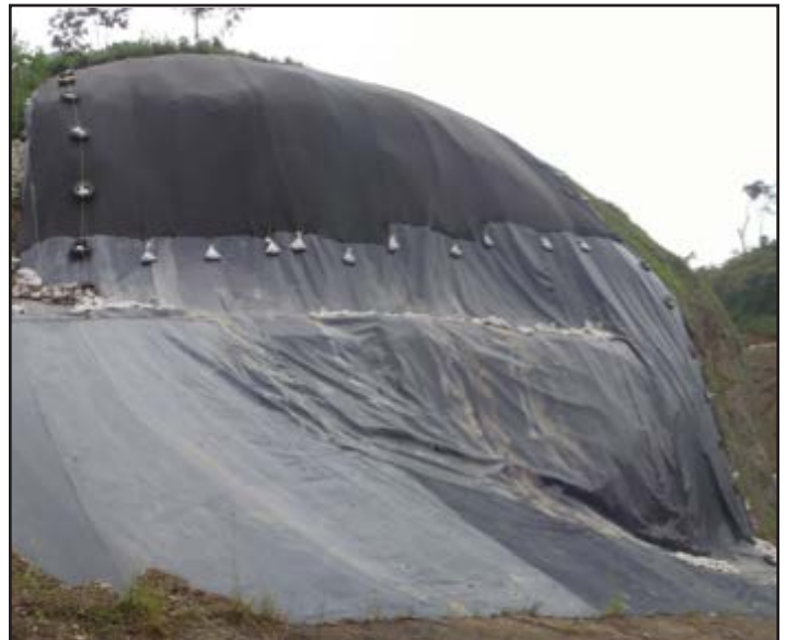
Figure 7. Completely lined pilot program slope.

During the pilot program, the owner, design engineer, driller, and liner installation contractor worked as a team to refine the liner system design and construction techniques. As a result, the pilot program was completed successfully (Figs. 6-7).