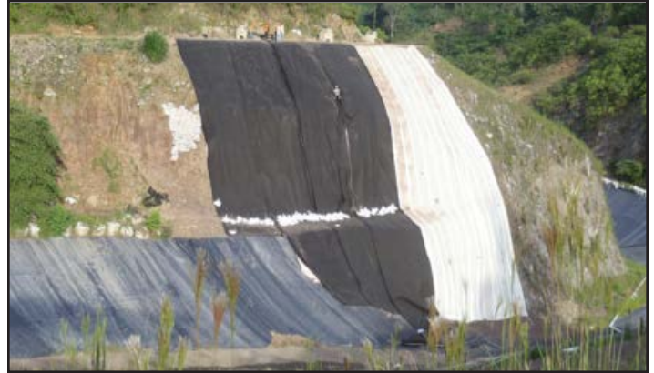
Figure 6. Pilot program slope during construction (geocomposite being installed over Tensar Mine-Grid™).

The staging areas at the top and bottom of the pilot program slope were narrow and precluded the use of man lifts or cranes. Therefore, manual liner deployment techniques were developed that considered the difficulties in working on high angle slopes in windy or wet conditions. The experienced technicians from the contractor, rock-bolt drillers, and local laborers were trained in high-angle work and rappelling to support the liner system installation and ensure a safe work environment.