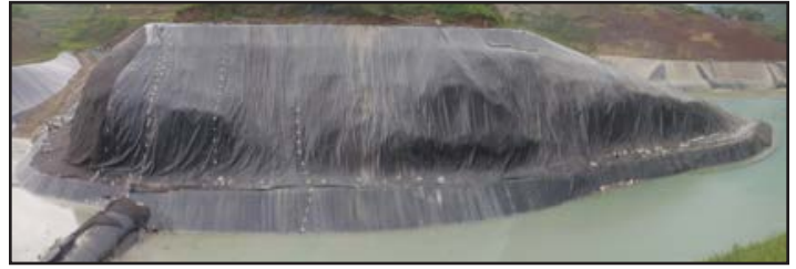
Figure 10. Soledad TSF slope completely lined

Once anchored to the plinth using a stainless steel compression strip, the LLDPE liner was deployed in pre-cut sections. The panels were then welded to the adjacent panels and the existing liner (Fig. 10). The welds and liner were inspected using industry accepted QAQC controls and test procedures.