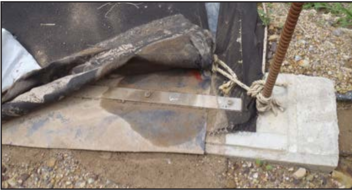
Figure 4. Geomembrane and geocomposite anchored to plinth.