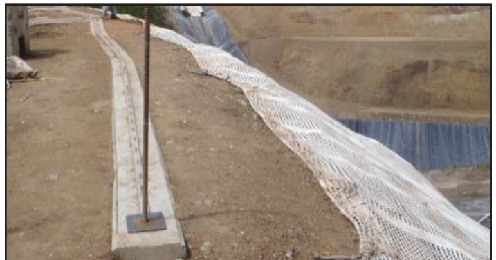
Figure 3. Concrete anchor plinth.

Shallow bedrock precluded using a standard anchor trench for the lining system. A structural concrete anchor plinth, connected to the rock mass using #8 rock bolts (DYWIDAG #8 Thread-bar), was designed to anchor the geocomposite and geomembrane liner at the top of the slope (Figs. 3-4). The geocomposite and geomembrane liner were attached to the concrete plinth using a ¼-in-thick, 2-in wide stainless steel bar anchored every 0.15 m with ½-in stainless steel bolts.