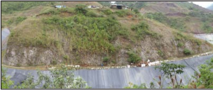
Figure 8. Soledad TSF slope prior to slope preparation.

Once slopes were prepared, labor crews constructed the anchor plinth and the drilling contractor installed rock bolts on the specified grid spacing. The rock bolts were proof tested and then cut to within 0.3 m of the rock face.