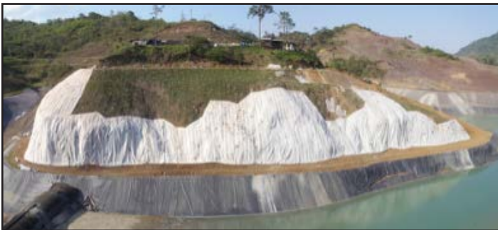
Figure 9. Soledad TSF slope following slope preparation and Tensar MineGrid™ installation.

The Tensar MineGrid™ was deployed in pre-cut sections. The top of each panel was folded over and stitched using a diamond weave pattern specified by the manufacturer to create a sheath for an anchor cable that was connected to dedicated rock anchor bolts along the anchor plinth. The sections were then adjusted to ensure proper contact with the slope, proper anchoring with the rock bolts, and the correct overlap with adjacent panels. Adjacent panels were stitched together using the same diamond weave specified for the top sheath. Retention plates were then installed on the rock bolts. Any excess bolt was cut off, a grout cap was cast over the plate and bolt head, and sections of conveyor belt were installed to further protect the liner system from the bolts. Vertical cables were installed as needed to ensure proper contact between the Tensar MineGrid™ and the rock face. Finally, cable sheaths were created at the lateral extents and base of the Tensar MineGrid™ and cables were installed to effectively tie the reinforcement system together.