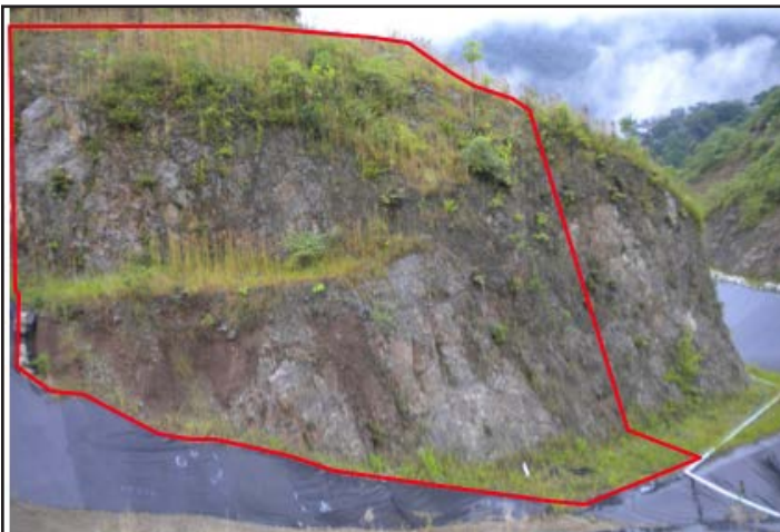
Figure 5. Pilot program slope (approximate limits outlined).

The pilot program consisted of a 25-m-long (approximate) section of a 25-m-high, near vertical rock face (Fig. 5).