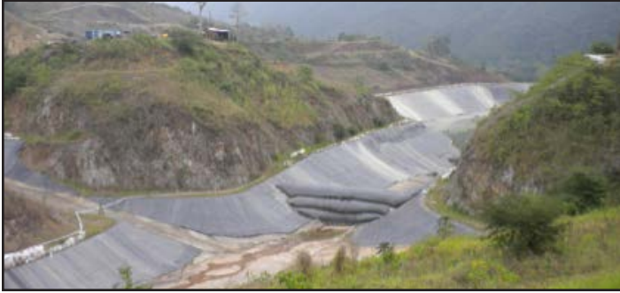
Figure 1. View of steep-walled canyon within the Soledad TSF.

Grading beyond the limits of the Stage 1 impoundment was not completed due to topographic and budgetary constraints. As a result, near vertical (55 to 90 degree), blocky limestone slopes were left in situ within 3 m of the lined Phase 1 facility (Fig. 1).