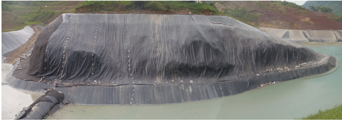
Figure 10. Soledad TSF slope completely lined

Finally, a sacrificial, 6-oz non-woven geotextile (Agru America Agrutex 061) was installed over the LLDPE liner to provide UV protection. The geotextile was anchored to the anchor plinth and connected to adjacent panels using heat adhesion.