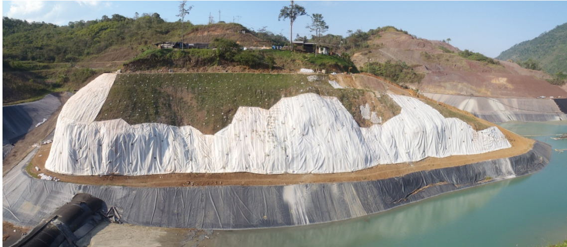
Figure 9. Soledad TSF slope following slope preparation and Tensar MineGrid™ installation.

The Tensar MineGrid™ was deployed in pre-cut sections. The top of each panel was folded over and stitched using a diamond weave pattern specified by the manufacturer to create a sheath for an anchor cable that was connected to dedicated rock anchor bolts along the anchor plinth. The sections were then adjusted to ensure proper contact with the slope, proper anchoring with the rock bolts, and the correct overlap with adjacent panels. Adjacent panels were stitched together using the same diamond weave specified for the top sheath. Retention plates were then installed on the rock bolts. Any excess bolt was cut off, a grout cap was cast over the plate and bolt head, and sections of conveyor belt were installed to further protect the liner system from the bolts. Vertical cables were installed as needed to ensure proper contact between the Tensar MineGrid™ and the rock face. Finally, cable sheaths were created at the lateral extents and base of the Tensar MineGrid™ and cables were installed to effectively tie the reinforcement system together.