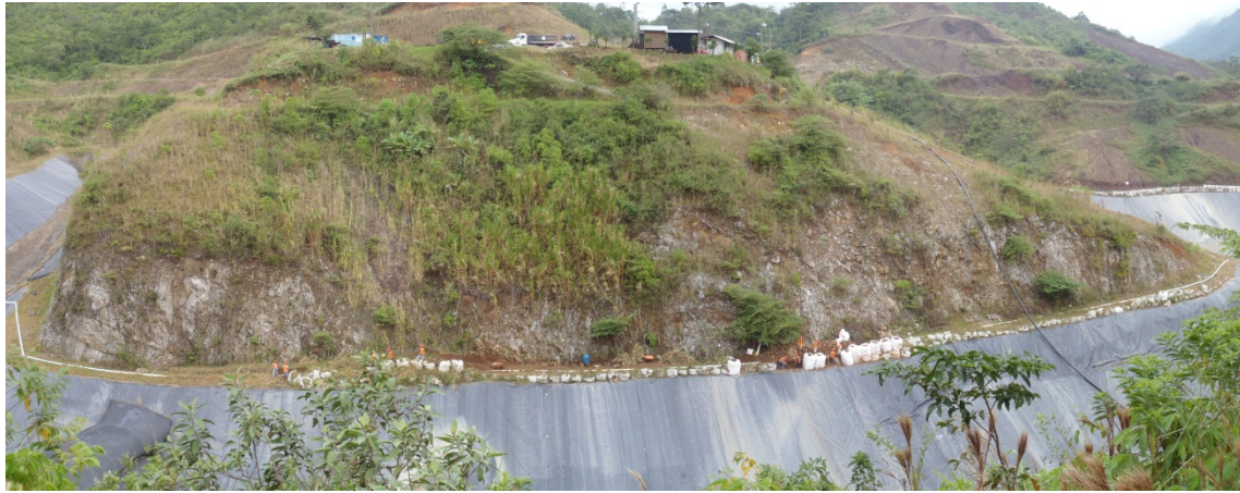
Figure 8. Soledad TSF slope prior to slope preparation.

The Tensar MineGrid™ was deployed in pre-cut sections. The top of each panel was folded over and stitched using a diamond weave pattern specified by the manufacturer to create a sheath for an anchor cable that was connected to dedicated rock anchor bolts along the anchor plinth. The sections were then adjusted to ensure proper contact with the slope, proper anchoring with the rock bolts, and the correct overlap with adjacent panels. Adjacent panels were stitched together using the same diamond weave specified for the top sheath. Retention plates were then installed on the rock bolts. Any excess bolt was cut off, a grout cap was cast over the plate and bolt head, and sections of conveyor belt were installed to further protect the liner system from the bolts. Vertical cables were installed as needed to ensure proper contact between the Tensar MineGrid™ and the rock face. Finally, cable sheaths were created at the lateral extents and base of the Tensar MineGrid™ and cables were installed to effectively tie the reinforcement system together.