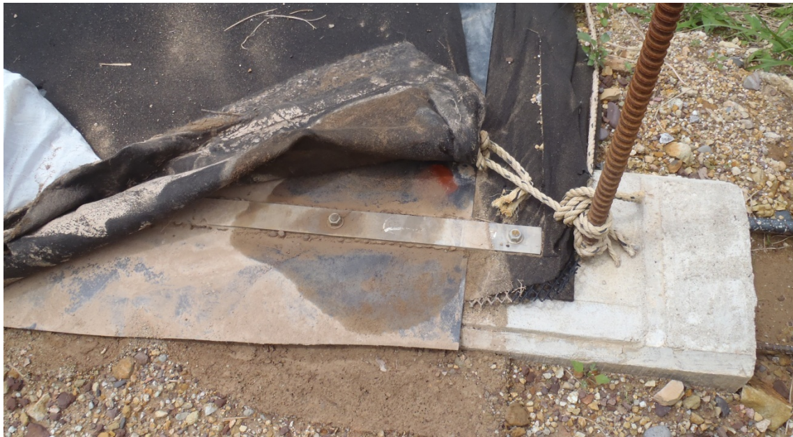
Figure 4. Geomembrane and geocomposite anchored to plinth.