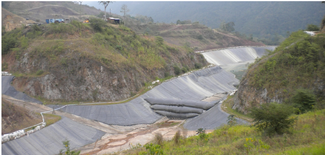
Figure 1. View of steep-walled canyon within the Soledad TSF.

Grading beyond the limits of the Stage 1 impoundment was not completed due to topographic and budgetary constraints. As a result, near vertical (55 to 90 degree), blocky limestone slopes were left in situ within 3 m of the lined Phase 1 facility (Fig. 1).