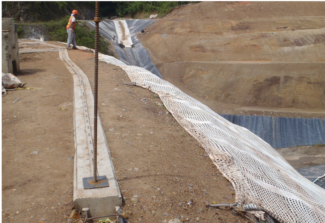
Figure 3. Concrete anchor plinth.

Shallow bedrock precluded using a standard anchor trench for the lining system. A structural concrete anchor plinth, connected to the rock mass using #8 rock bolts (DYWIDAG #8 Thread-bar), was designed to anchor the geocomposite and geomembrane liner at the top of the slope (Figs. 3-4). The geocomposite and geomembrane liner were attached to the concrete plinth using a 1/4-in-thick, 2-in wide stainless steel bar anchored every 0.15 m with 1/2-in stainless steel bolts.