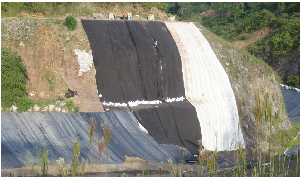
Figure 6. Pilot program slope during construction (geocomposite being installed over Tensar MineGrid™).

The staging areas at the top and bottom of the pilot program slope were narrow and precluded the use of man lifts or cranes. Therefore, manual liner deployment techniques were developed that considered the difficulties in working on high angle slopes in windy or wet conditions. The experienced technicians from the contractor, rock-bolt drillers, and local laborers were trained in high-angle work and rappelling to support the liner system installation and ensure a safe work environment.