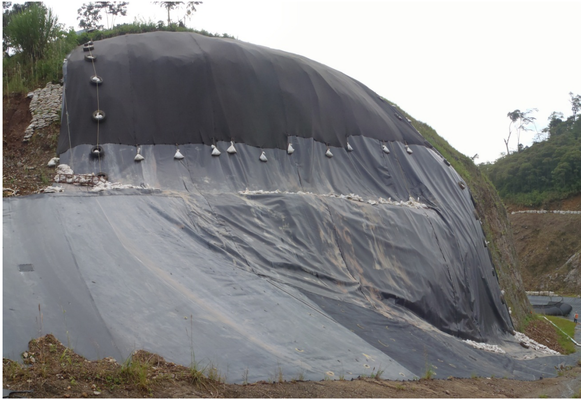
Figure 7. Completely lined pilot program slope.

During the pilot program, the owner, design engineer, driller, and liner installation contractor worked as a team to refine the liner system design and construction techniques. As a result, the pilot program was completed successfully (Figs. 6-7).