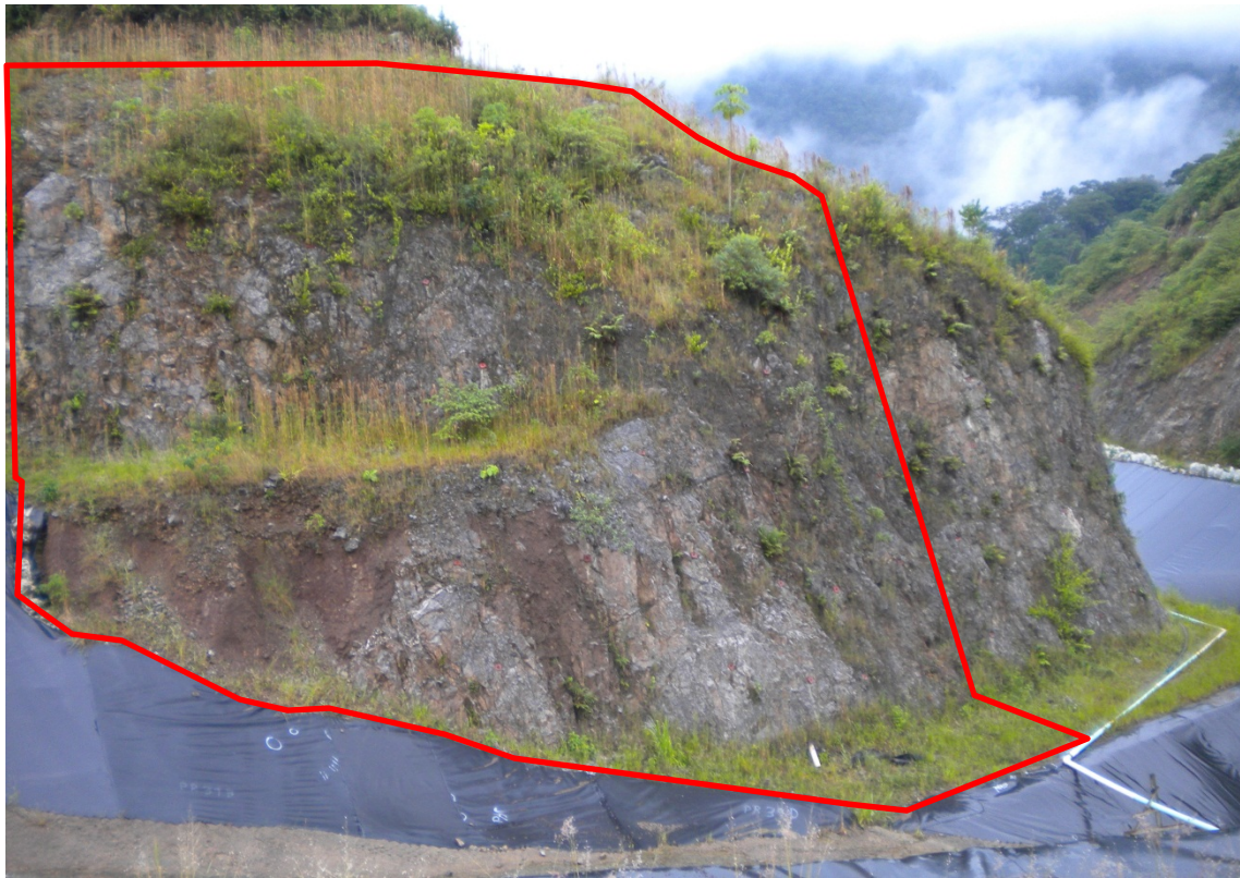
Figure 5. Pilot program slope (approximate limits outlined).

The staging areas at the top and bottom of the pilot program slope were narrow and precluded the use of man lifts or cranes. Therefore, manual liner deployment techniques were developed that considered the difficulties in working on high angle slopes in windy or wet conditions. The experienced technicians from the contractor, rock-bolt drillers, and local laborers were trained in high-angle work and rappelling to support the liner system installation and ensure a safe work environment.